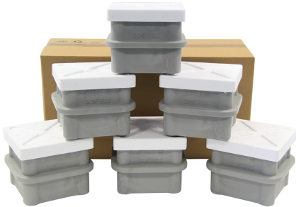
55-C0100/P156 Cube moulds