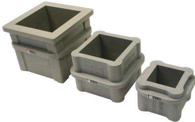
55-C0100/P20, 55-C0100/P15, 55-C0100/P10