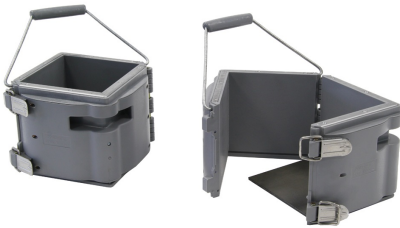
55-C0100/P15A Precise and economic , metal bottom and rims for long life, easy demoulding, easy to handle, ideal for site use.