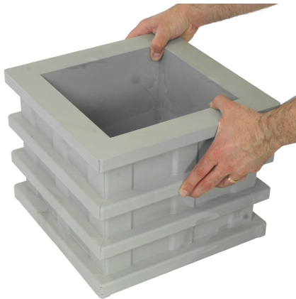
55-C0100/P25 Detail for plastic cube mould