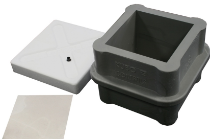
55-C0100/P15 Kubo 15, 150 mm plastic cube mould. Supplied complete with polystyrene cover- for save transportation and thermal protection-, base sheet and stopper.